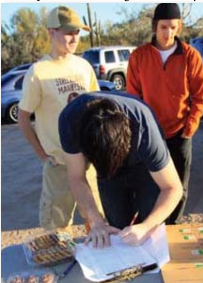
Cactus Shadows Sustainability Club Members Sign-In

Friends of the Scenic Drive, a volunteer arm of the nonprofit Greater Pinnacle Peak Association, was one of the first organizations to participate in Scottsdale's Adopt-A-Road Program. Friends, with the support of the City of Scottsdale, maintains the drive's roadside plant exhibits and monuments and works to protect and enhance the drive as an amenity for tourists and residents. Beautification projects conducted or supported by Friends have included re-vegetation of roadside, painting utility boxes and traffic signs and posts to blend into the natural environment, undergrounding power lines, and organizing Cookout at the Ranch, north Scottsdale's largest preservation benefit, and more. The Desert Foothills Scenic Drive was created in 1963 by residents of Cave Creek and Carefree when the area was under the jurisdiction of Maricopa County. After annexation of the area by Scottsdale, Friends assumed the drive's maintenance, which was originally the responsibility of the Cave Creek Improvement Association, with the mission of producing