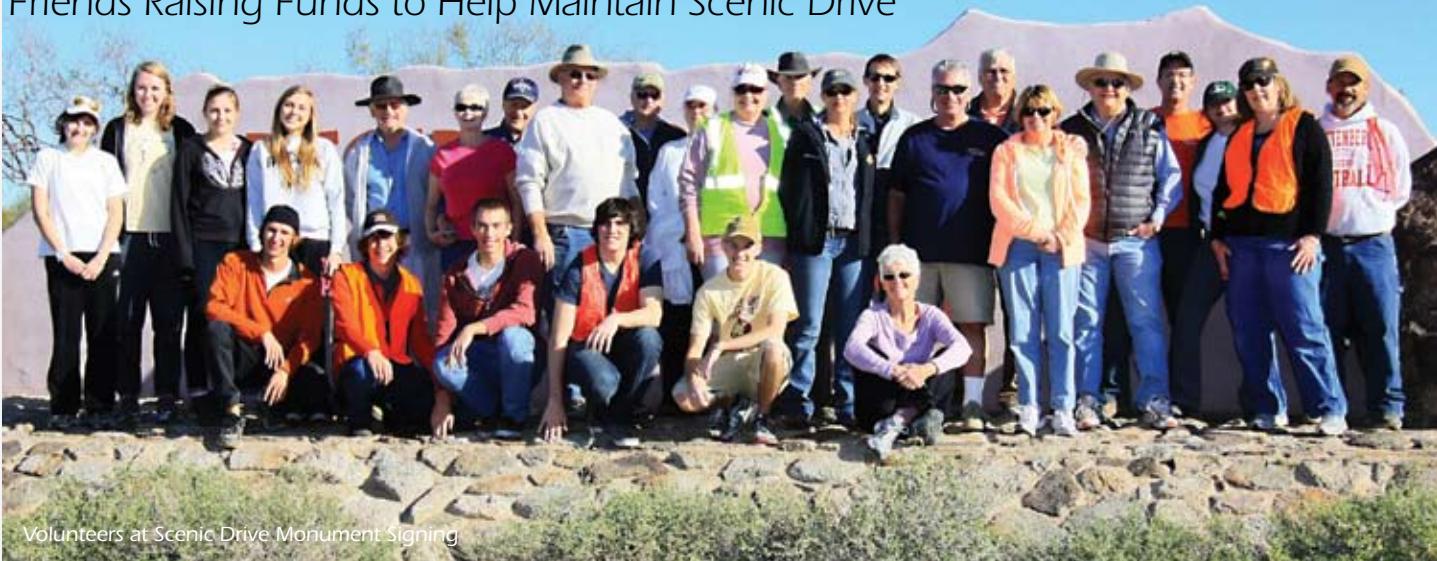
Volunteers at Scenic Drive Monument Signing

On Saturday, January 28 th , Friends of the Scenic Drive volunteers did what they have been doing for more than 15 years; they cleared litter from the 13 miles of northbound and southbound roadside, from Happy Valley Road to Carefree Highway, along Scottsdale Road. However, this time nine members of the Cactus Shadows Sustainability Club and members of the Scottsdale Rotary North Club reinforced the ranks. In fact, there were so many volunteers that Friends was able to clear an additional two miles of roadside, all in less than two hours.