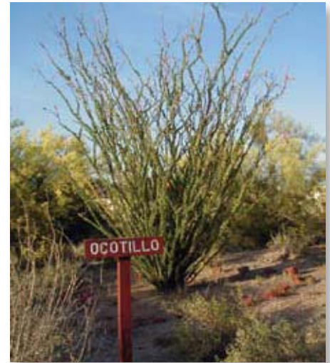
Litter-free Scenic Drive Plant Exhibit

Join our volunteer ranks on March 10 th , when Friends once again assaults the litter that has accumulated along our Desert Foothills Scenic Drive. If you don't have the time or disposition to join