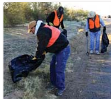
Volunteers at Work